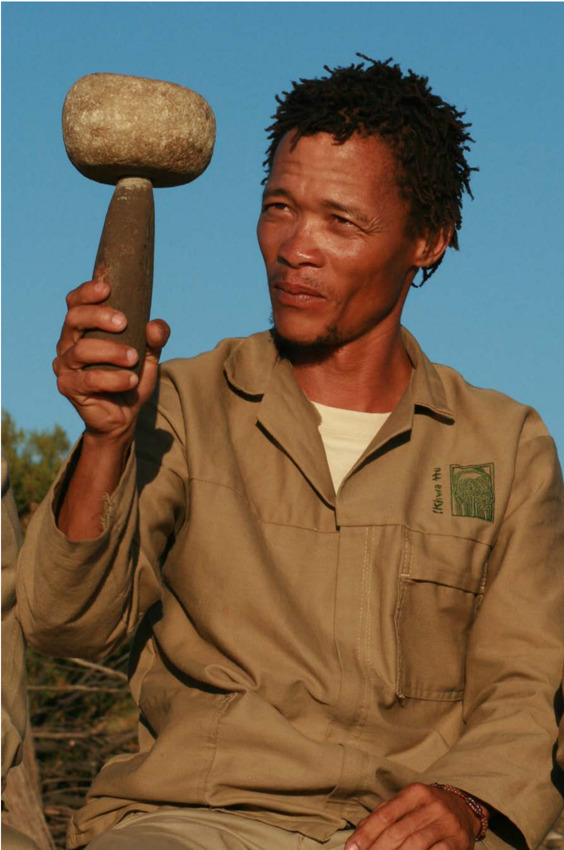
Celebrating San culture at !Khwaa ttu, South Africa.