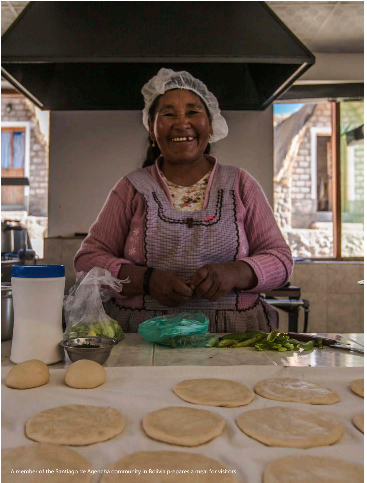
A member of the Santiago de Agencha community in Bolivia prepares a meal for visitors.