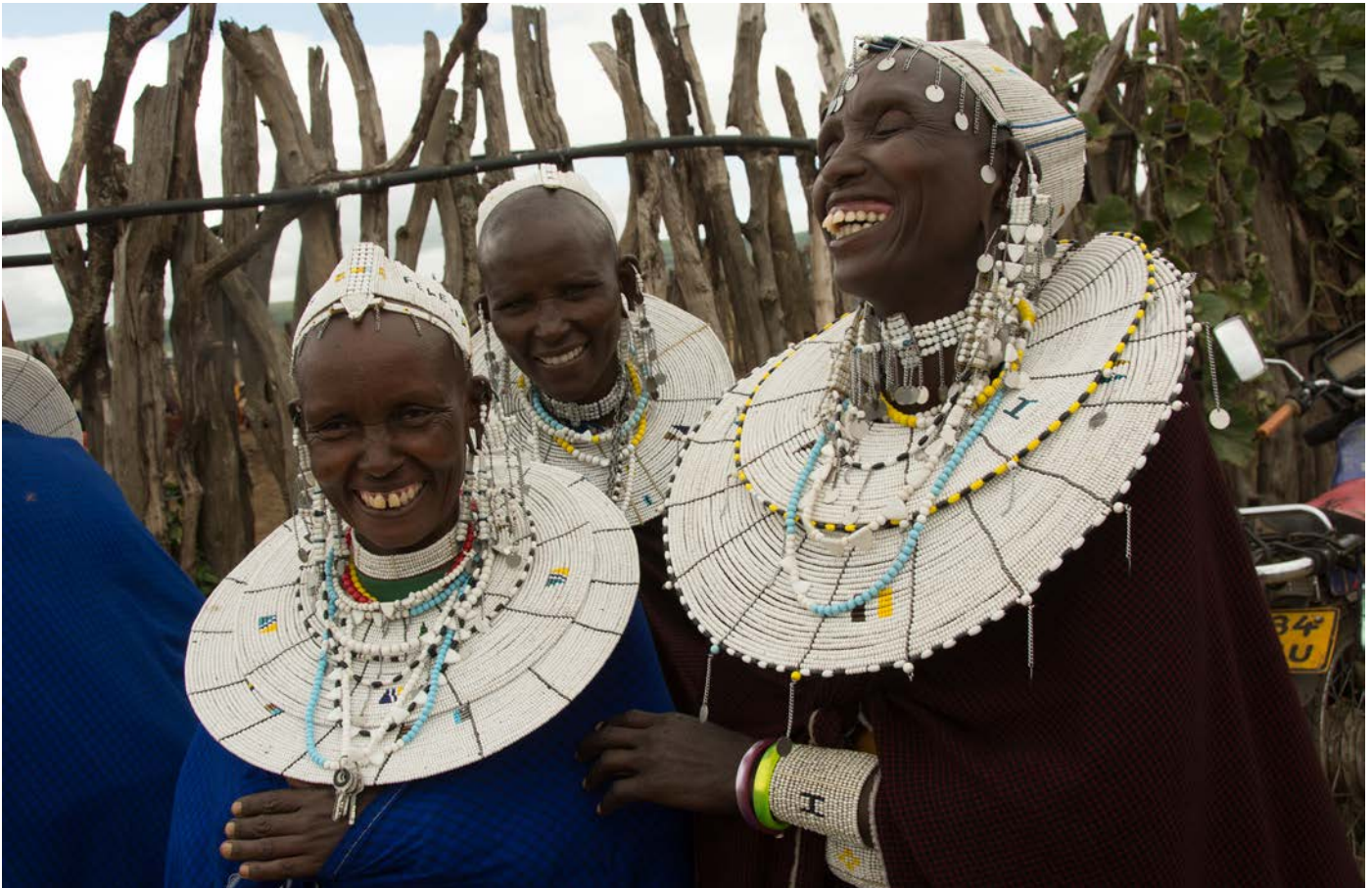
Maasai women welcome tourists to their community.