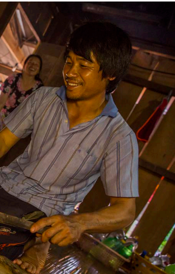
A homestay meal being prepared by a host in Thailand.

When determining whether a guideline is applicable to a particular situation, travel companies can gain objectivity by asking themselves whether a third party, for example, would agree that the guideline in question had been applied in a reasonable manner. In other words, does the guideline correspond with the situation? Does the situation justify the application of the guideline? The guidelines are divided into three subsections: developing, operating and marketing tourism experiences. Travel company staff may focus on one or more of these sections as applicable, and use the corresponding key actions as a check list.