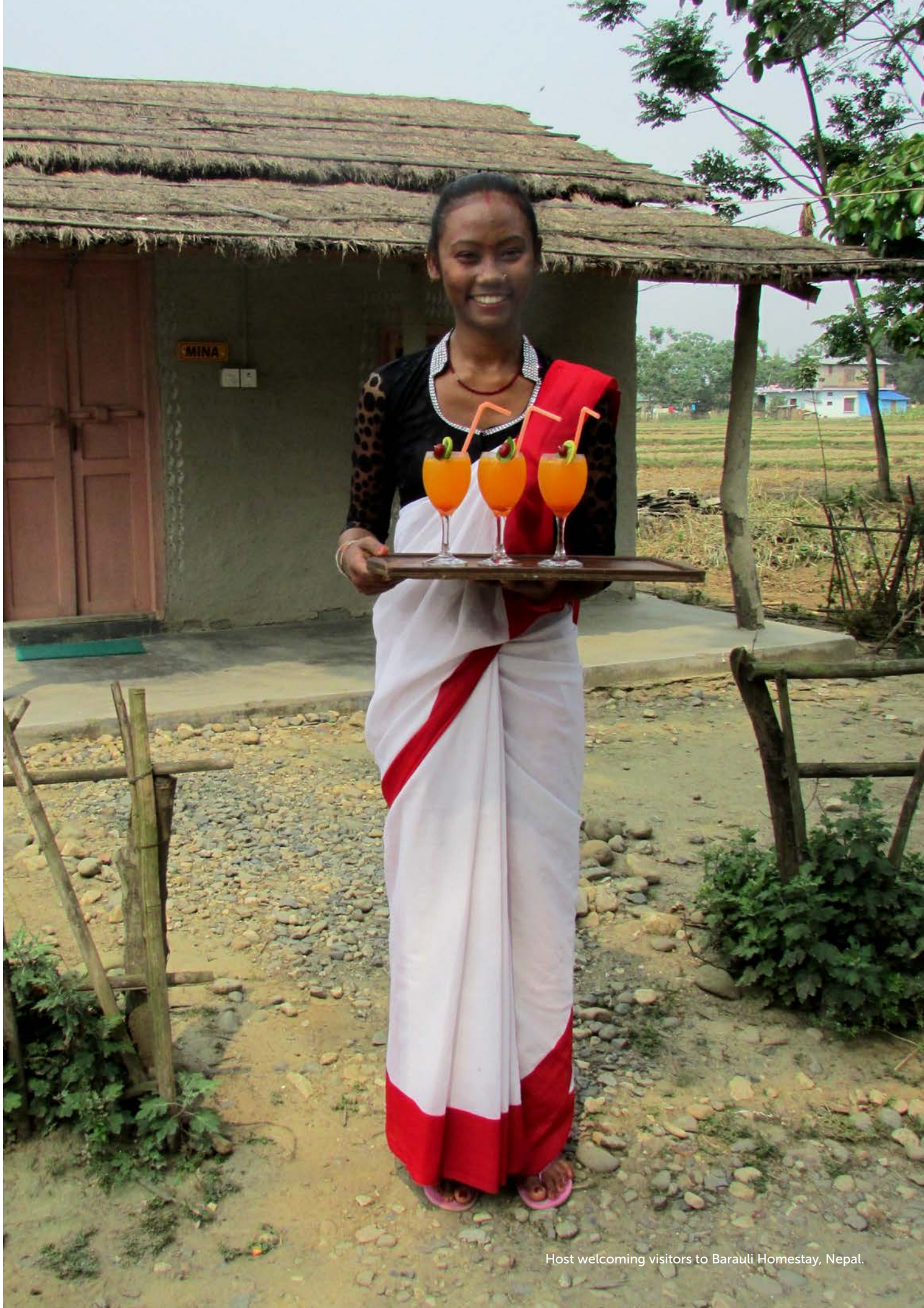
Host welcoming visitors to Barauli Homestay, Nepal.