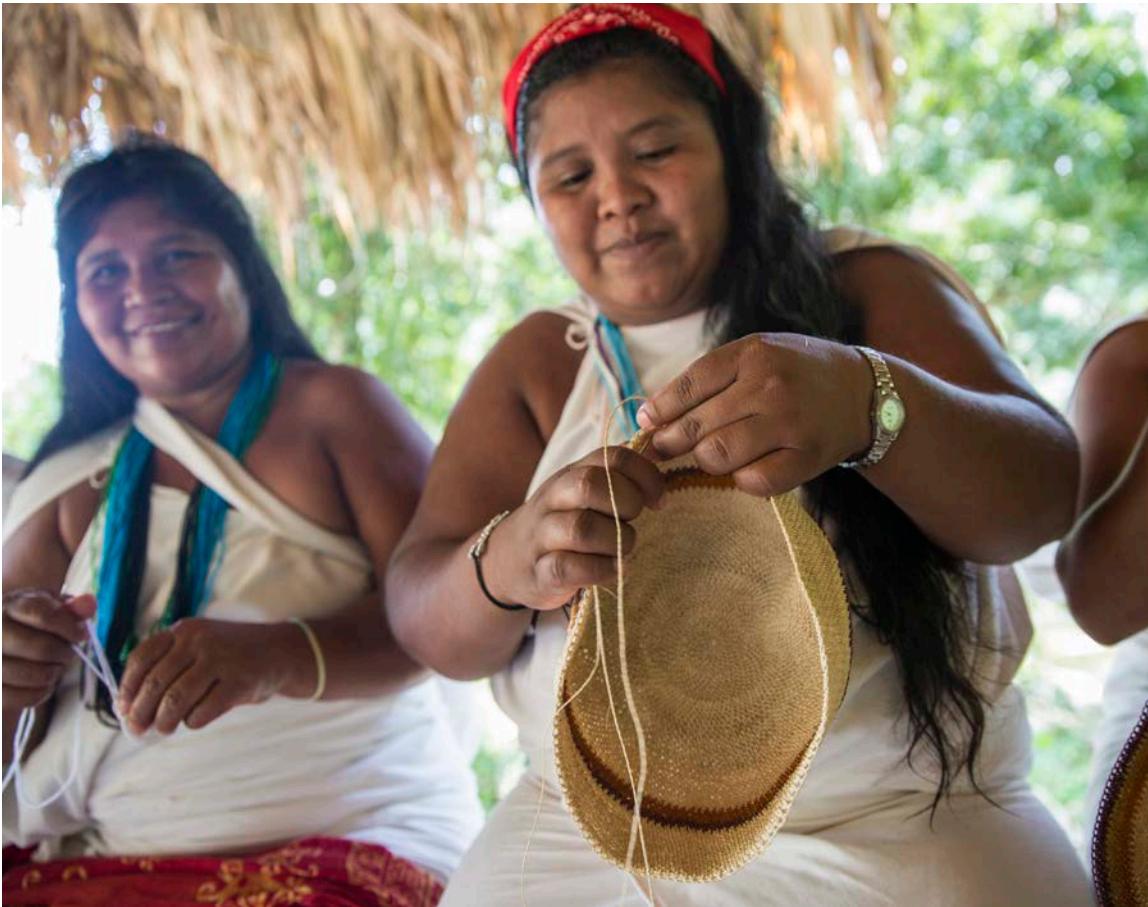
Members of Colombia's Wiwa community show homemade crafts to visitors.