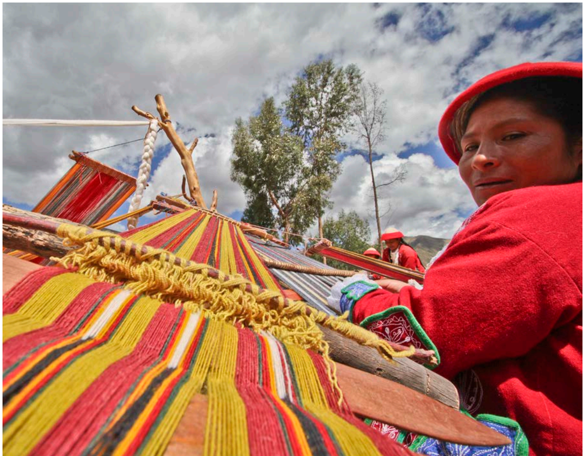
A member of Peru's Ccaccacollo Women's Weaving Co-op demonstrates traditional artisan techniques.