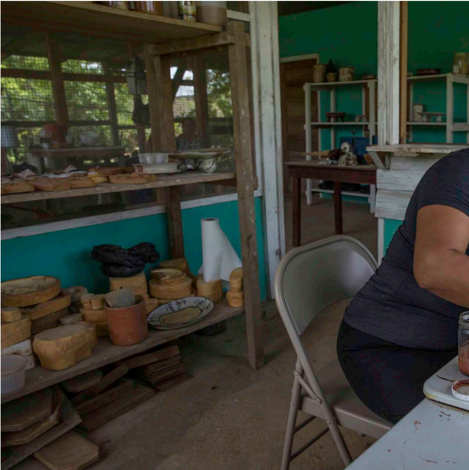
President of the San Antonio Women's Group in Belize paints Mayan pottery.